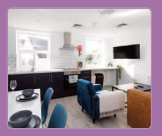
Prince of Wales Accommodation