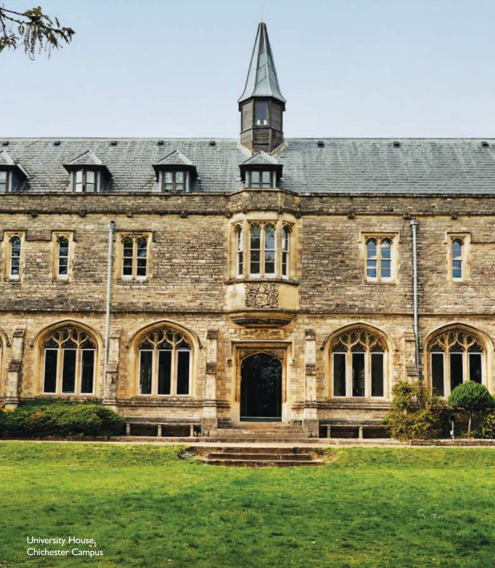
University House, Chichester Campus