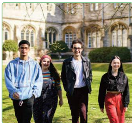
Cloisters, Chichester Campus