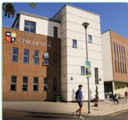
Academic Building, Chichester Campus