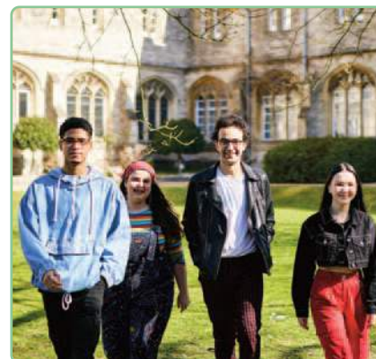
Cloisters, Chichester Campus