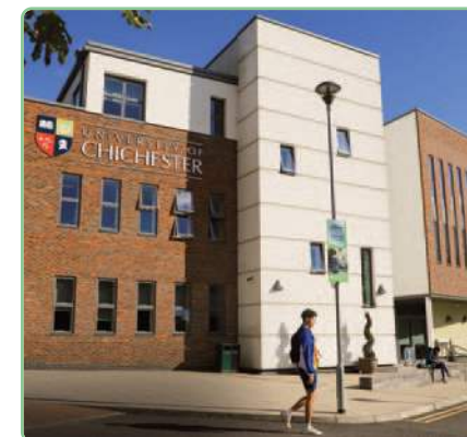
Academic Building, Chichester Campus