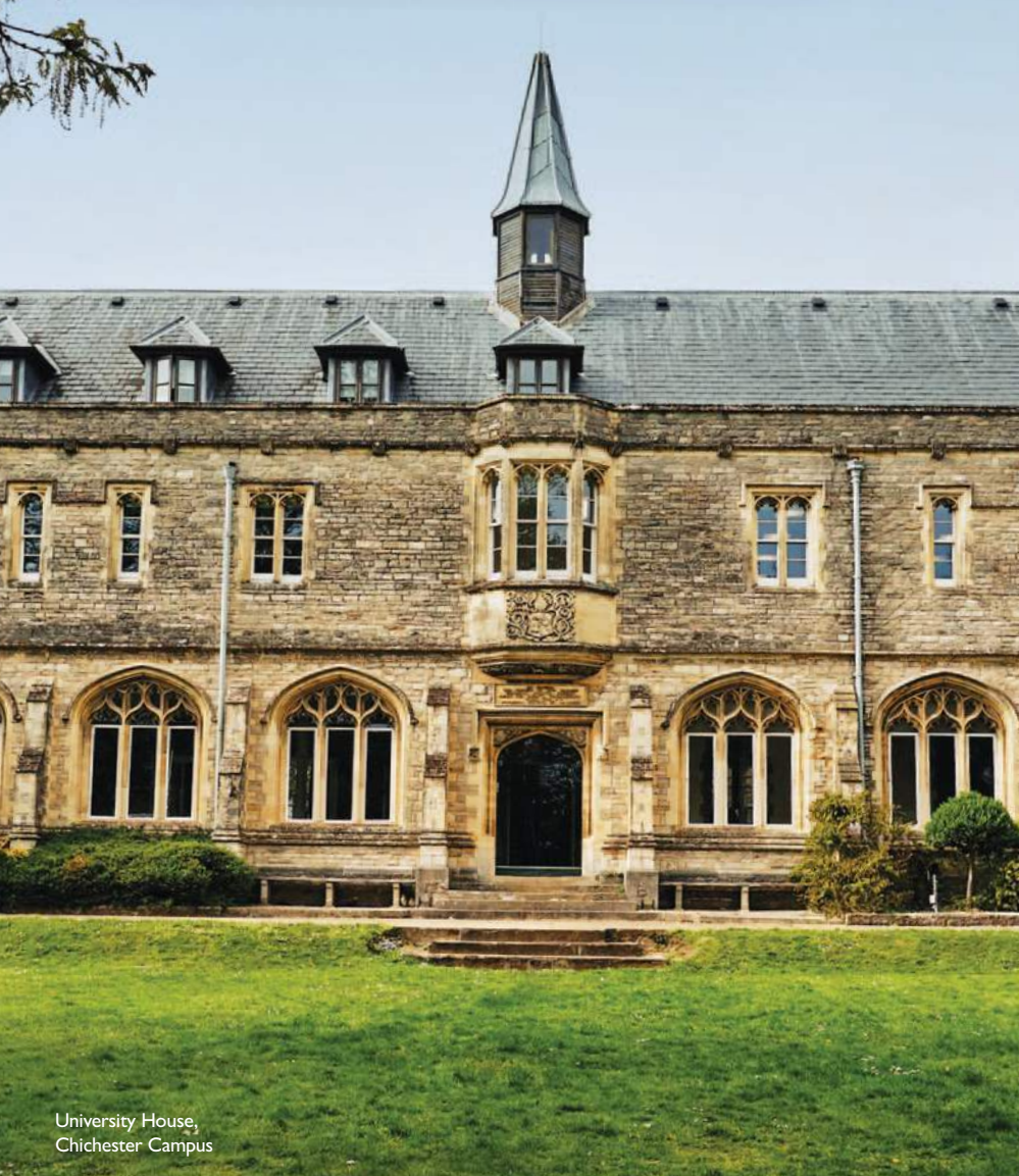
University House, Chichester Campus