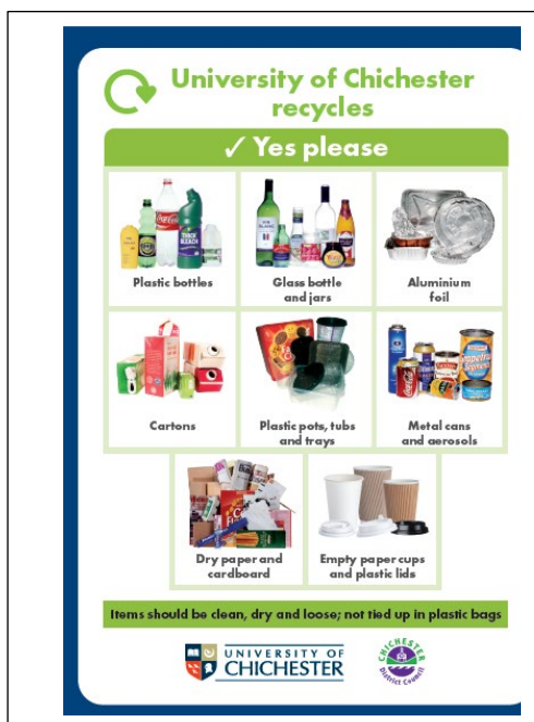
Figure 2 Signage for recyclable waste