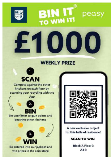
Figure 4 Smart Segregation signage used at Stockbridge

In September 2024, a scheme called Smart Segregation was introduced in our Stockbridge Halls of Residence. This scheme uses AI to reward students who recycle properly by awarding them with “coins” (Figure 4). Individual prizes and prizes for the most successful kitchen are provided to incentivise participation. This scheme will be extended to Fishbourne Halls of residence from September 2025.