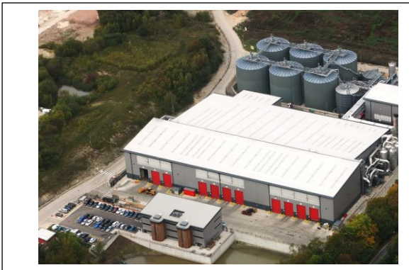
Figure 9 MBT Plant at Brookhurst Wood