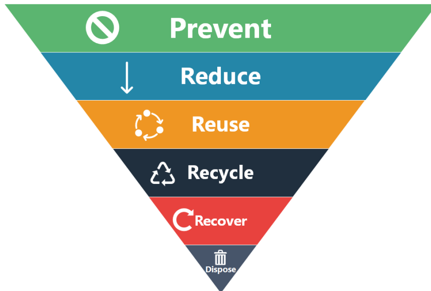
Figure 1 The waste hierarchy

The Waste Hierarchy ranks waste management options according to their impact on the environment. As a mandatory requirement of the Waste (England & Wales) Regulations 2011 it should be considered when deciding what the best option is to manage a waste stream. This places more emphasis on waste prevention, and requires organisations to consider preparing waste for reuse, then seeking opportunities for recycling, before options such as anaerobic digestion, energy recovery, incineration or landfill.