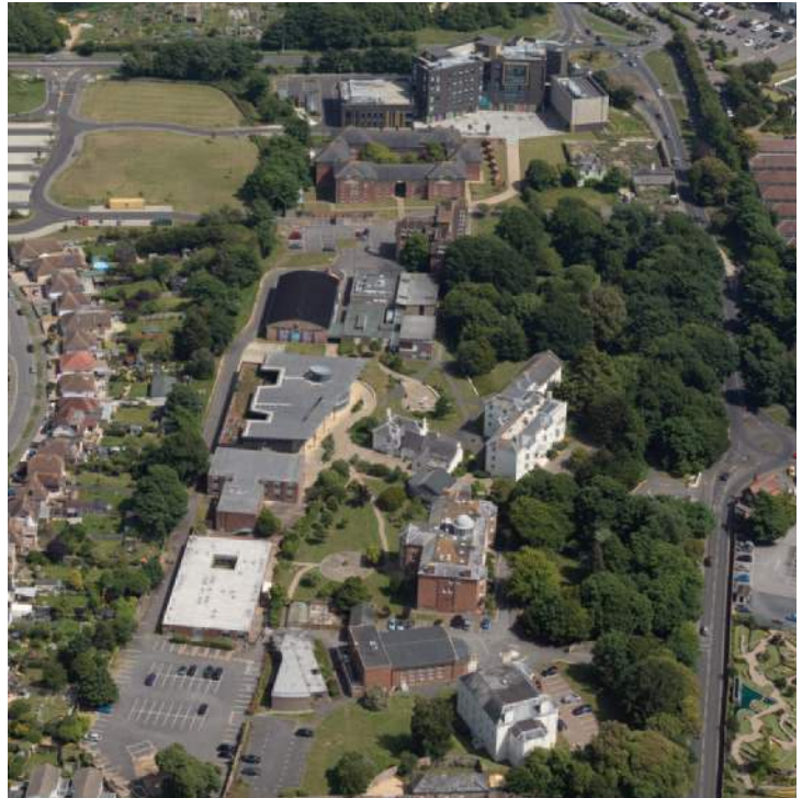
Above – Bognor Regis campus, aerial view

By car – Bognor Regis campus – Felpham Way entrance, PO22 7BN