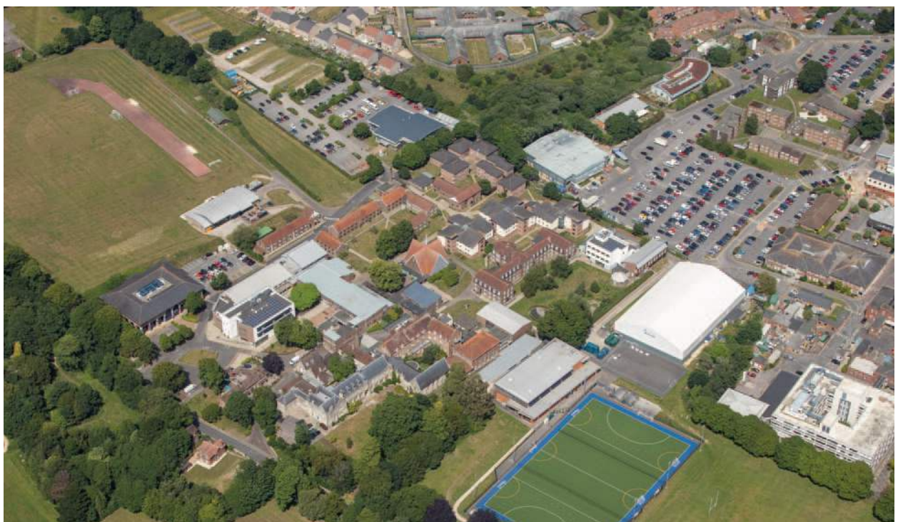
Below – Chichester campus, aerial view