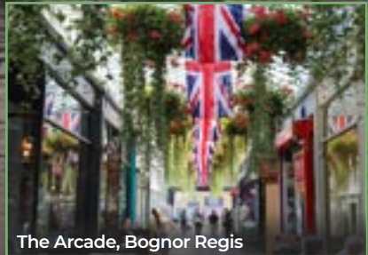
The Arcade, Bognor Regis