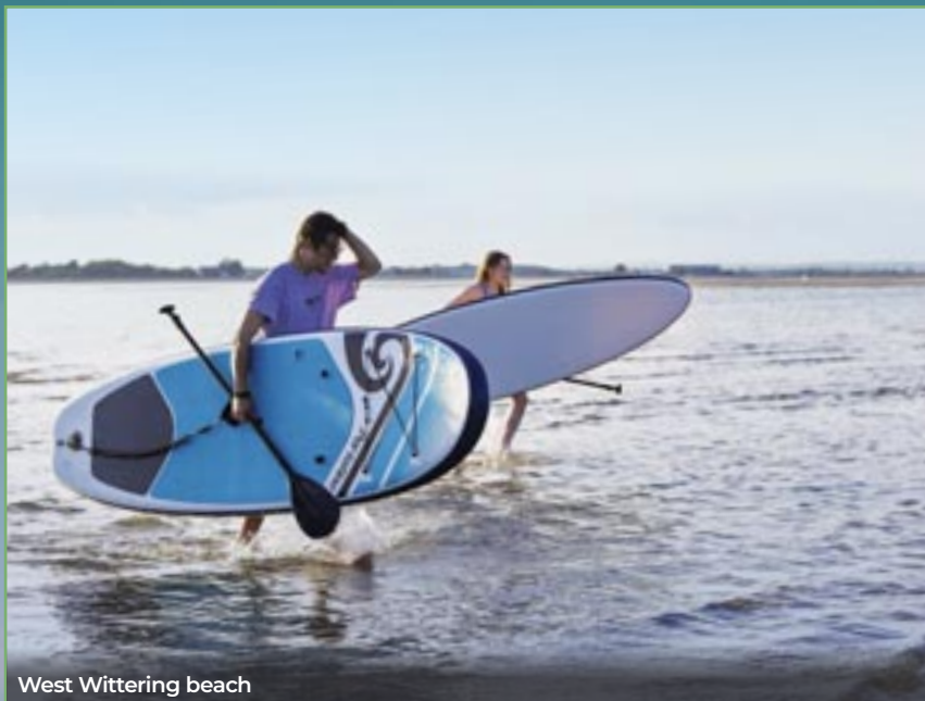
West Wittering beach

You will have lots of places to visit and new activities to try – right on your doorstep.