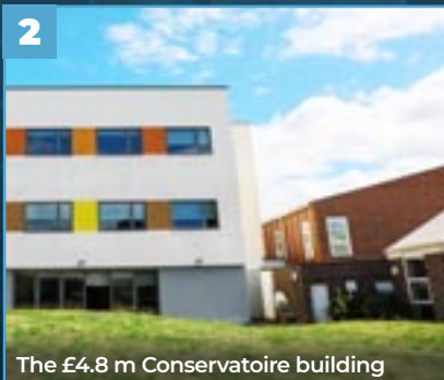
The £4.8 m Conservatoire building