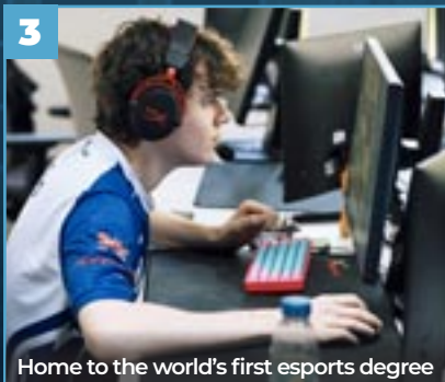
Home to the world's first esports degree