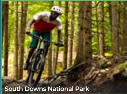
South Downs National Park