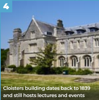
Clusters building dates back to 1839 and still hosts lectures and events