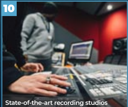
State-of-the-art recording studios