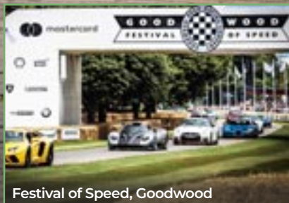
Festival of Speed, Goodwood