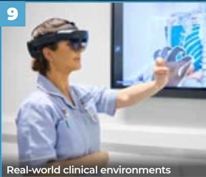
Real-world clinical environments