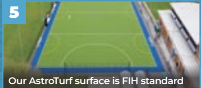
Our AstroTurf surface is FIH standard