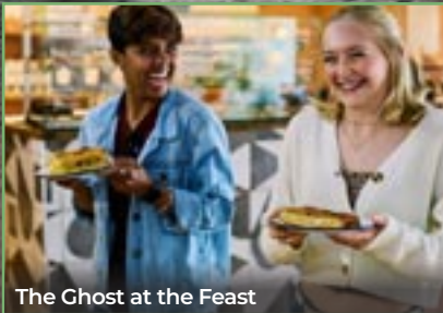
The Ghost at the Feast