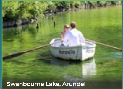
Swanbourne Lake, Arundel