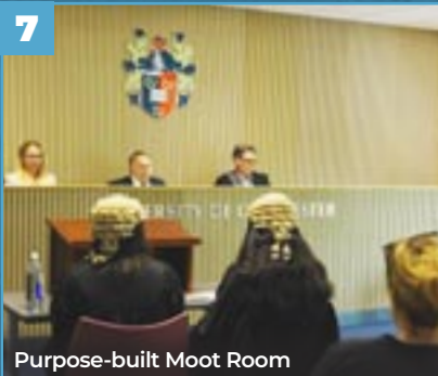
Purpose-built Moot Room